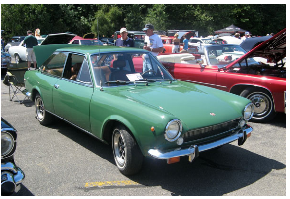
Cantigny Car Show Sept 16<sup>th</sup>