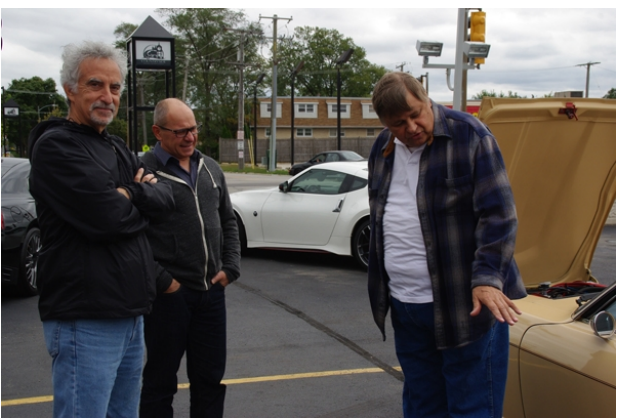
Octoberfest Contínental Níssan