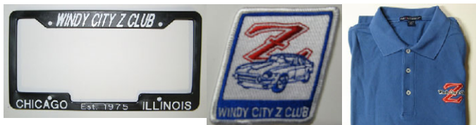
WCZC patch - $3/ea

License plate frames - $3/ea or $5/pair WCZC polo shirt - $30, specify size Contact Jeff at villazx10@comcast.net to purchase.