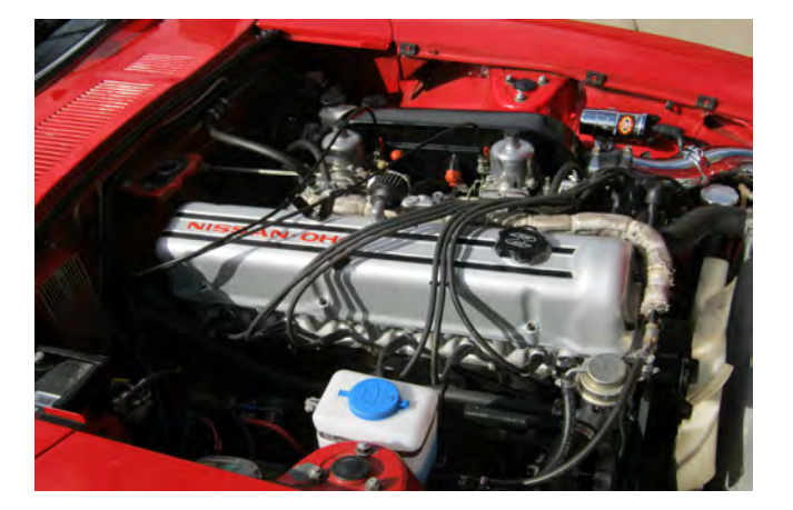
Paul Fox's 260 - See member column on page 3