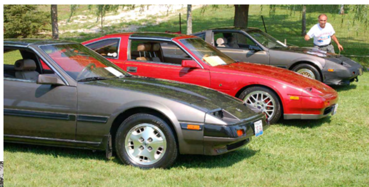
Cruisin' Z '07 Volo, IL Aug 11, 2007