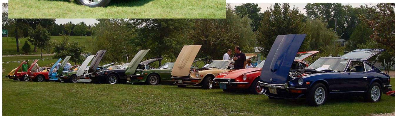
Autocross Madness JULY 29, 2007