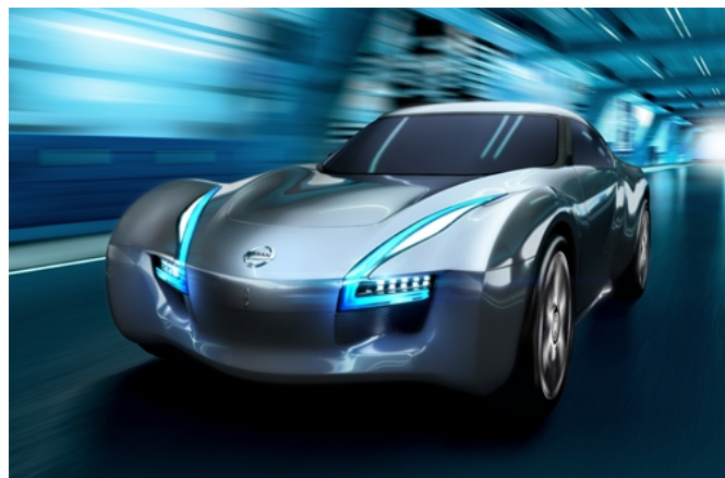
~ Nissan Esflow Concept ~

The 2011 Nissan Leaf represents many firsts for the Japanese automaker, including mass-produced EV technology and a unique platform. With those assets in hand, the automaker is showing what it can do beyond the Leaf with its Esflow Concept.