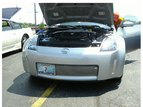
CRUISIN' Z USA Car Show Sunday June, 15, 2003

Sponsored by the Windy City Z Club at Emmons Coachworks 100 East Roosevelt Road, Villa Park 11:00 am to 3:00 pm