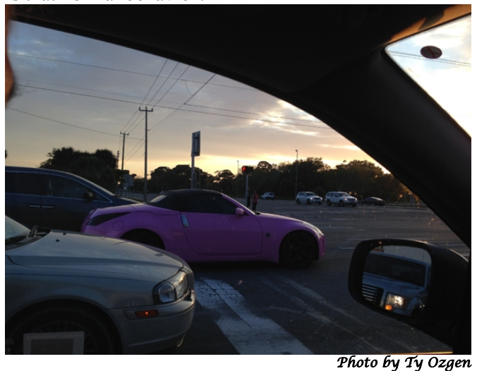
See you at the next event. \sim Ty

one day I swept all the debris away from my parking area. My area was now reasonably clean to park for the next morning. The best part, no one saw me doing it. Is that normal behavior?