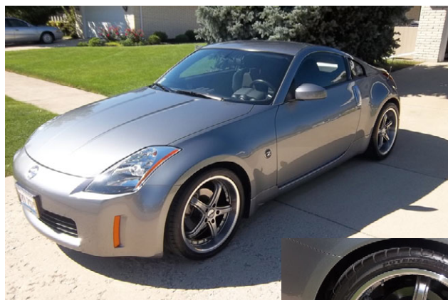
2004 350Z Color: Silverstone

"Showroom New" with just under 15,000 miles Original Owner pleasure car, never winter driven Base Model with 6-Speed Manual Transmission