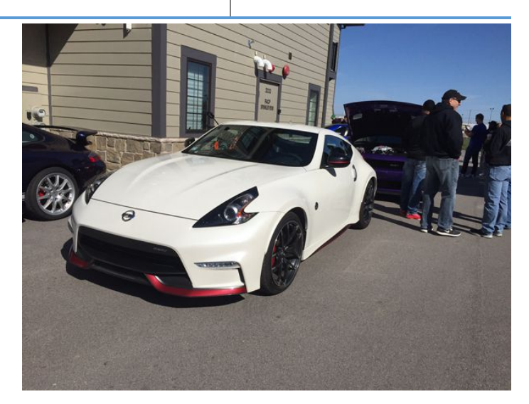
Chrome and Coffee – April 8, 2017