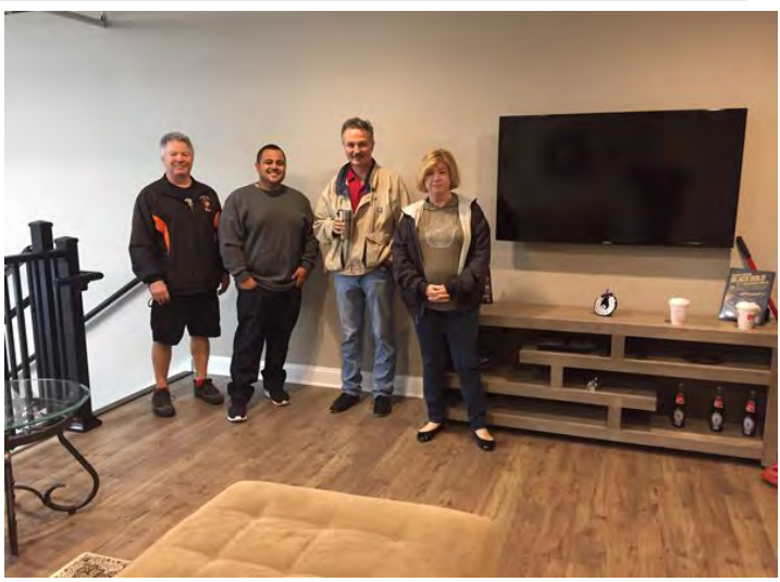
Coffee and Chrome-Chateau Ty