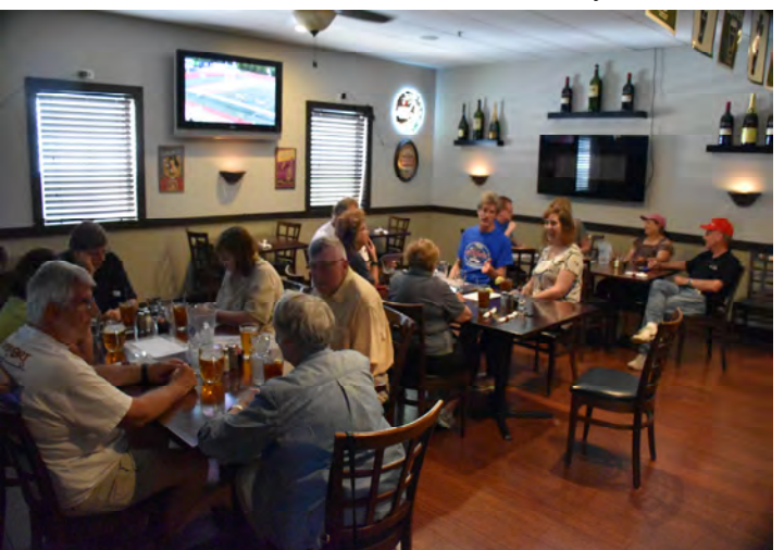
Manny's Ale House