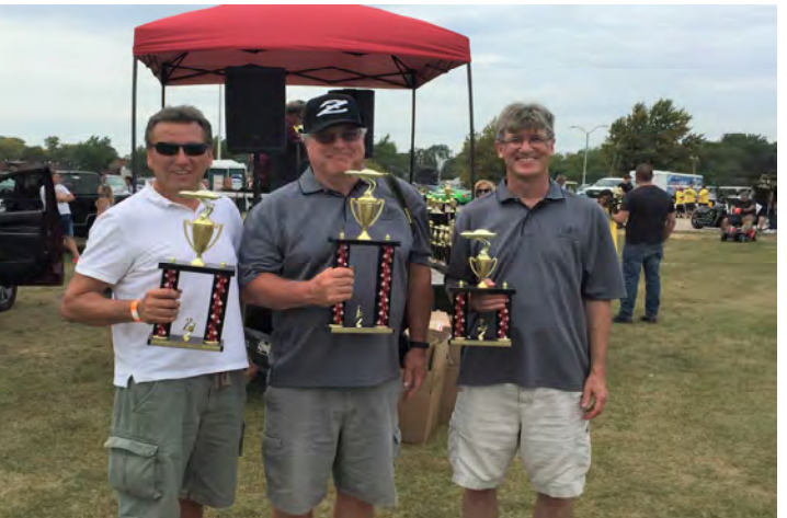
Glendale Heights Car Show-A Z Sweep