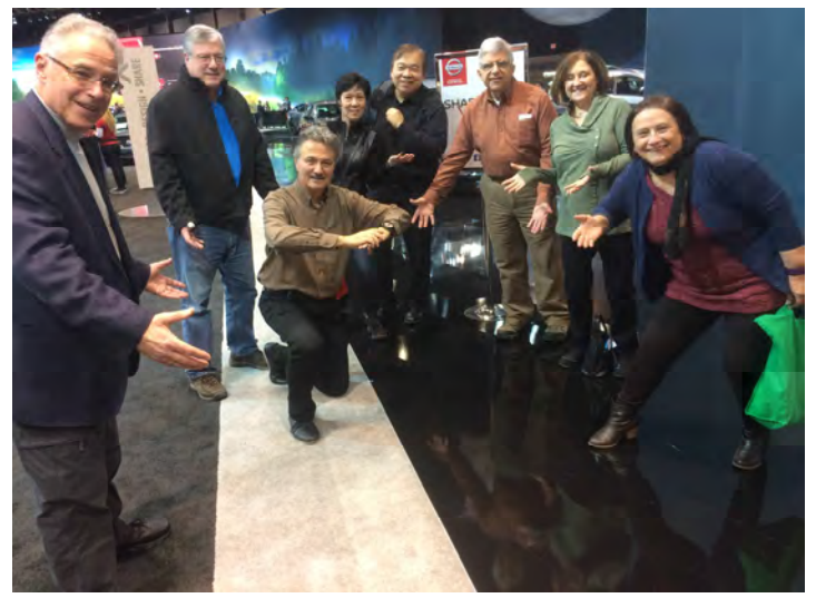
Auto Show-Where's the Z?