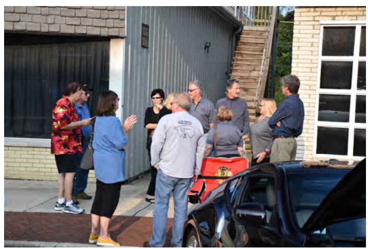
Westmont Cruise Night