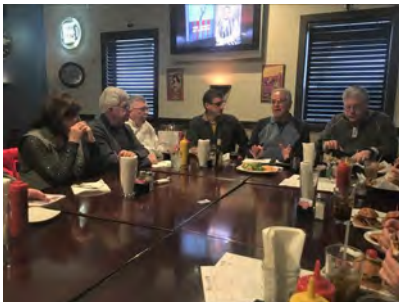
April General Meeting

Be sure to send photos of your cars to ZCCM magazine. They are looking for photos of all years, in any condition. Provide name, city, state, model, year, and club affiliation to arts.zccm@gmail.com