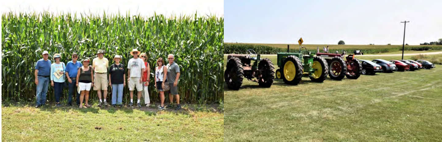
Children of the Corn