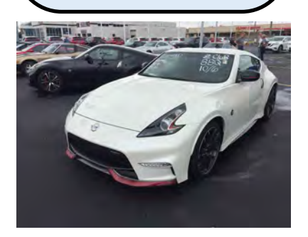
Ty's Dream Photo from Glenn J...

See full schedule on page 3 for more details